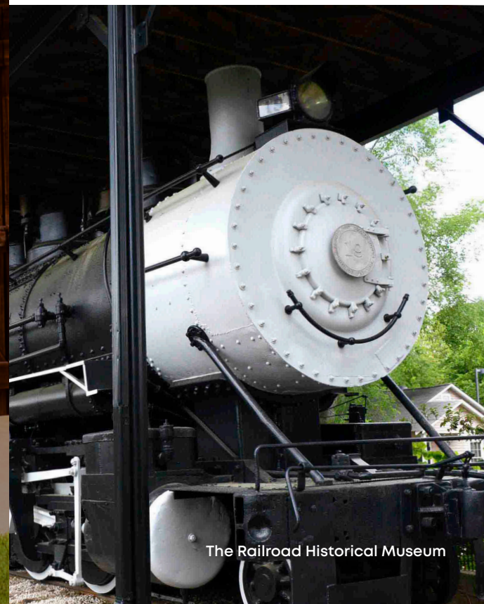
The Railroad Historical Museum

You can tour the birthplace of Benjamin Mays, and explore his monumental rise from sharecropper's son to one of the nation's most influential Civil Rights leaders. The site showcases several historic buildings and a museum.