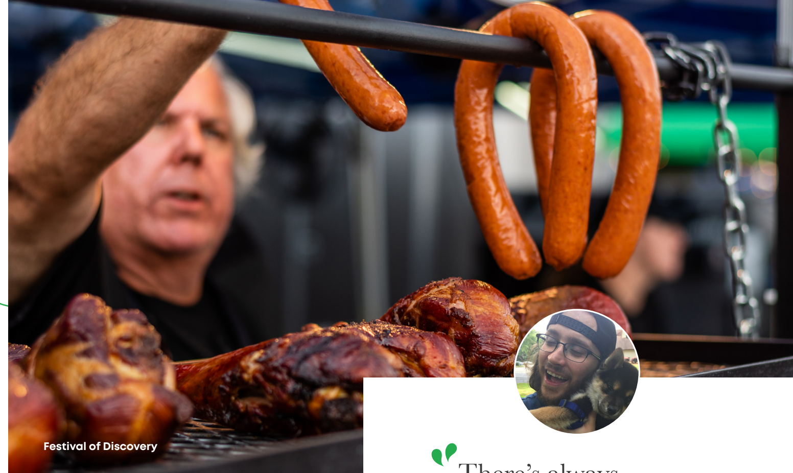
Festival of Discovery