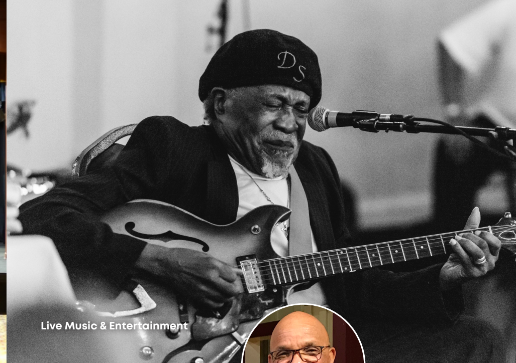
Live Music & Entertainment