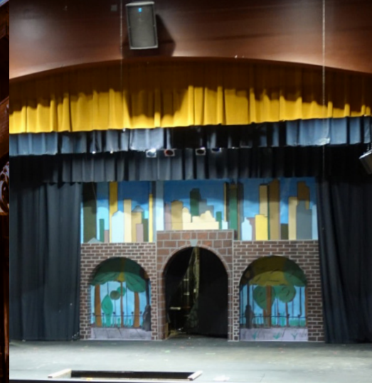
Greenwood Community Theatre