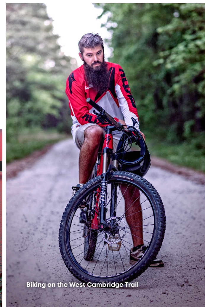
Biking on the West Cambridge Trail