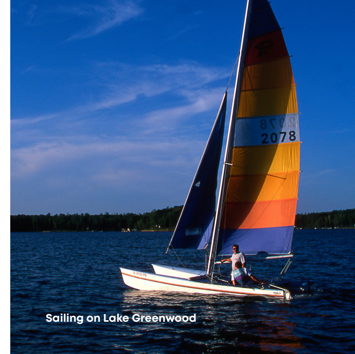
Sailing on Lake Greenwood

Several area parks offer opportunities to play outside. You'll find playgrounds, pavilions, picnic areas, and walking trails at West Cambridge Park, once a railroad-switching yard, and the small Magnolia Park in Uptown Greenwood. The new Grace Street Park has a walking trail, dog park, covered pavilion and restrooms. Wilbanks Sports Center and Recreation Complex features athletic fields, lighted tennis courts, jogging track, playgrounds, picnic shelters, Legion Baseball Stadium and a farmer's market.